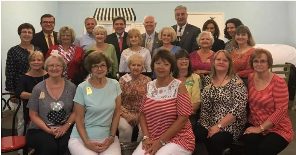
We had a full house for this meeting.