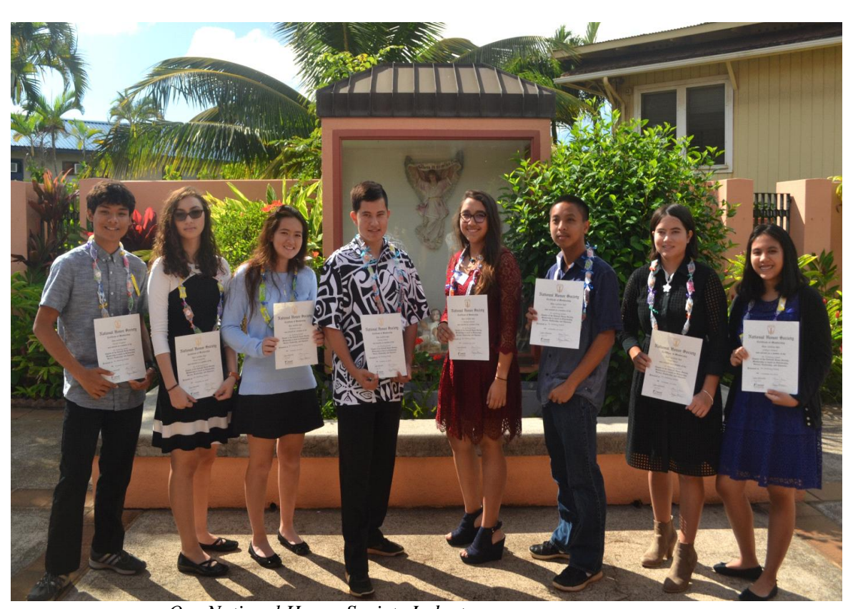
Our National Honor Society Inductees