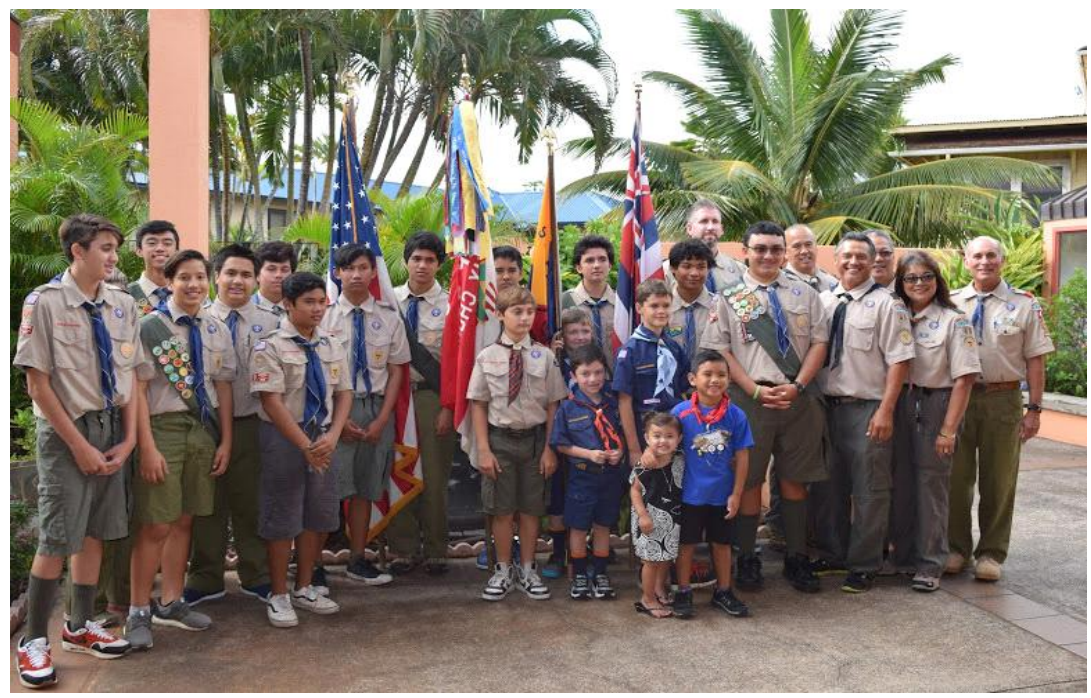
Our Boy Scouts and Cub Scouts