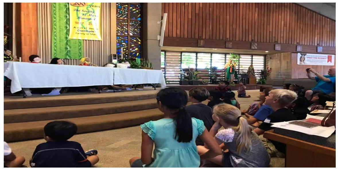
2017 Family Retreat - Puppet Show