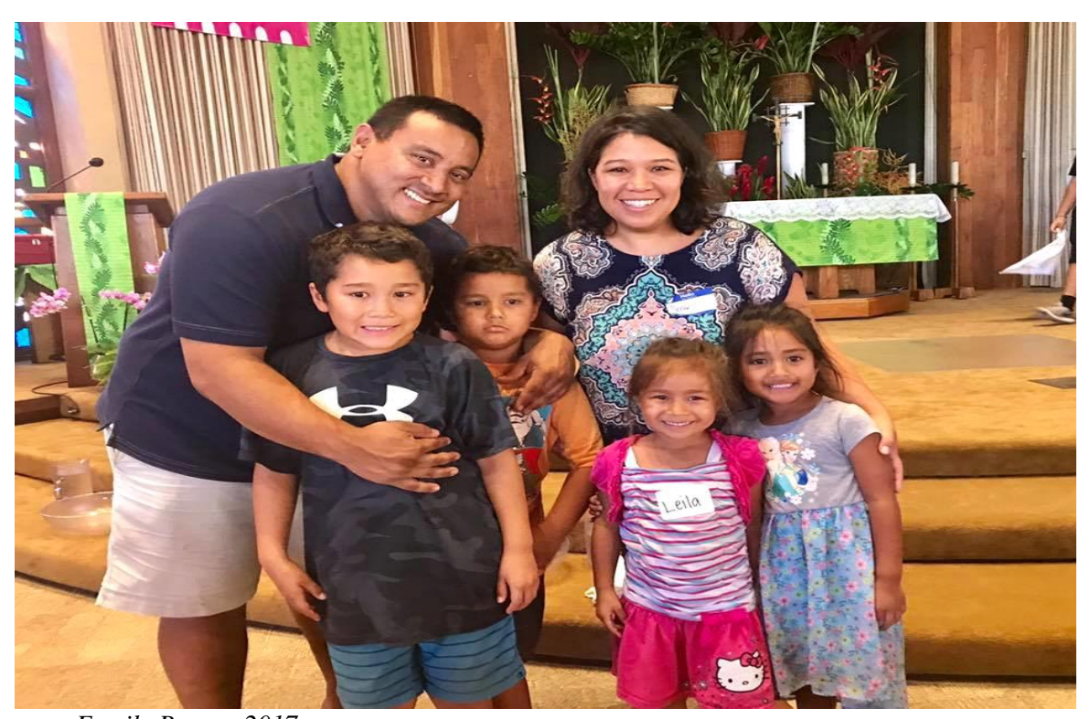
Family Retreat 2017