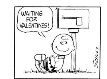
TREAT YOUR SPOUSE!