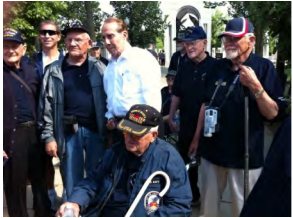
Legion Flight 311 taking WWII Veterans to view WWII Monument in Washington D.C.

Post 311 Members remain active within our community.