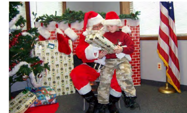
Annual Children's Christmas Party