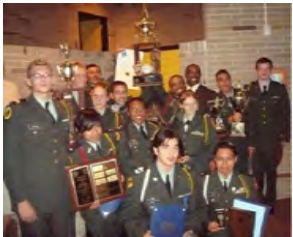
Post 311 sponsors the awards for the annual JROTC competition in Grand Rapids

Post 311 sponsors local students to attend the American Legion Boys and Girls State