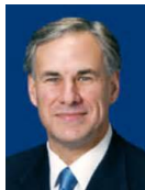
Greg Abbott www.gregabbott.com