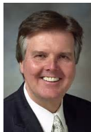
Dan Patrick www.DanPatrick.org