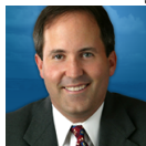
Ken Paxton http://KenPaxton.com