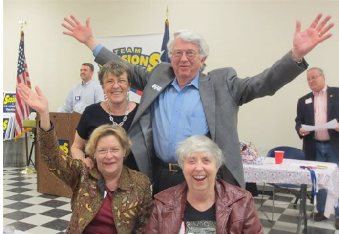
"Whiz Kids" (AKA "Infallibles") "Go for the 2014 Gold" in their 2nd sweep of FRW Trivia Night!

The First Republican Women's Trivia Fun 2014 brought in $1,075 to go to the GOP Candidates in the General Election! Thank You To All Supporters!