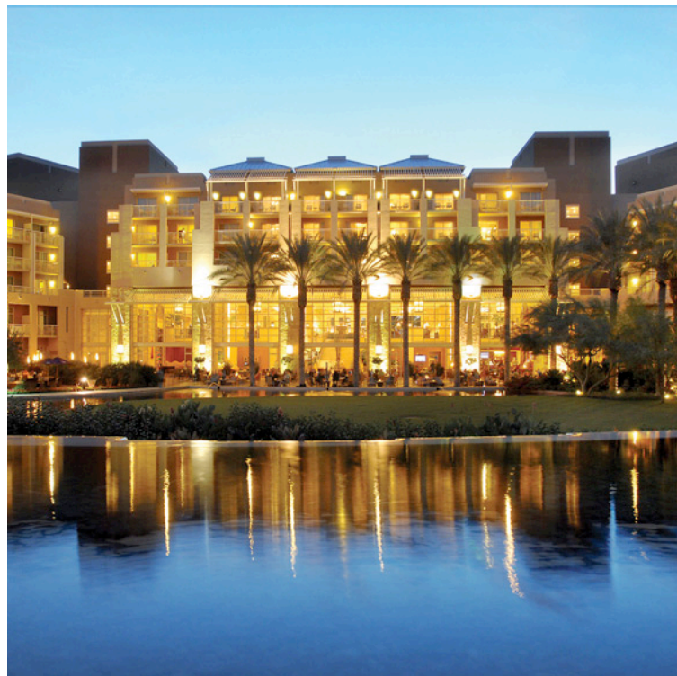
JW Marriott Desert Ridge Resort and Spa

Click here to go to the Convention website.