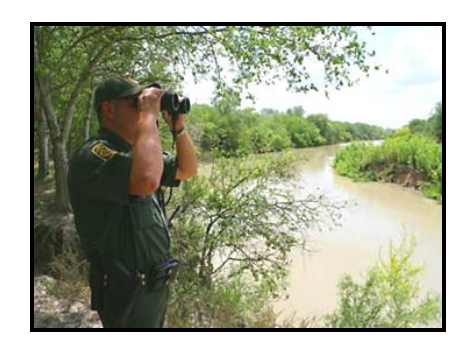
He's got answers !

He served as a Deputy United States Marshal in El Paso and Del Rio and has been a Team Member with Special Operations Group, fugitive apprehensions, Supreme Court Justice Protection Details, escape investigations, courtroom protection, and prisoner transport.