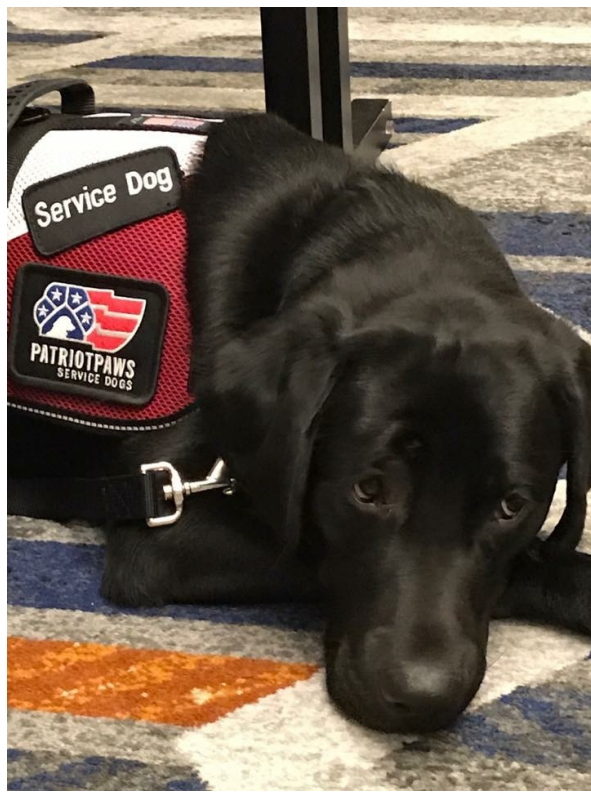
Tommy, a Patriot Paws Service Dog