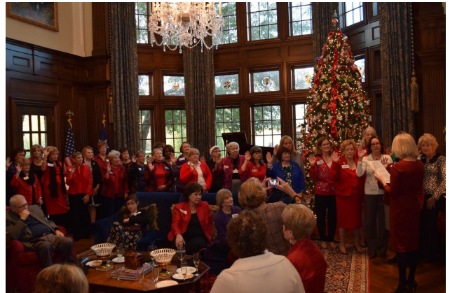
... Along with the Boards of Dallas Star RW, Northwood RW and Richardson RW who were installed at the same time ...