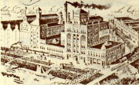
"Iowa's Oldest Brewery"