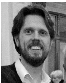
A Note from 2017 VCC President: