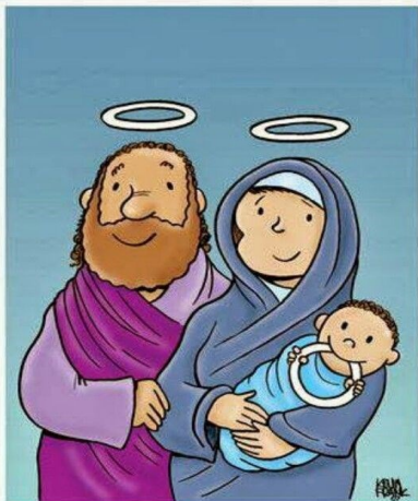
THE BABY JESUS STARTS TEETHING.

Remember if you change your address you need to let us know if you want to continue to receive this newsletter