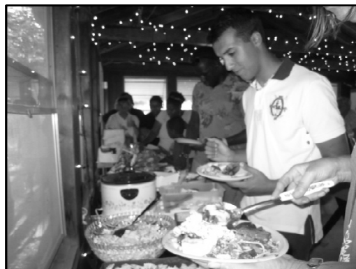
led the group with ajor at Vanderbilt