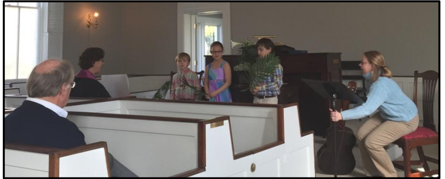
Children singing Easter Morning at MPC

The session met for a short called meeting on Sunday March 29 and approved the beginning of work on the fence around the church. The first phase will be the fence portion at the entrance of the church. Anyone interested in contributing to this work as it goes forward is welcome. We are encouraged by the desire to maintain the historic nature of the church.