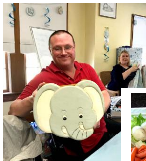
Babyshower for baby Klawitter