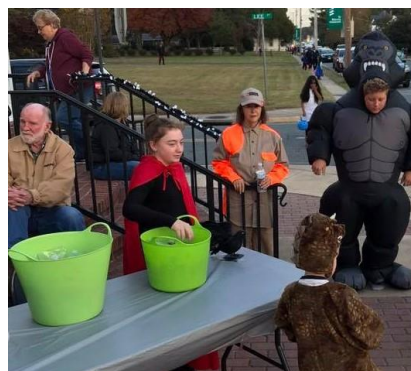
Mission Halloween! Success!