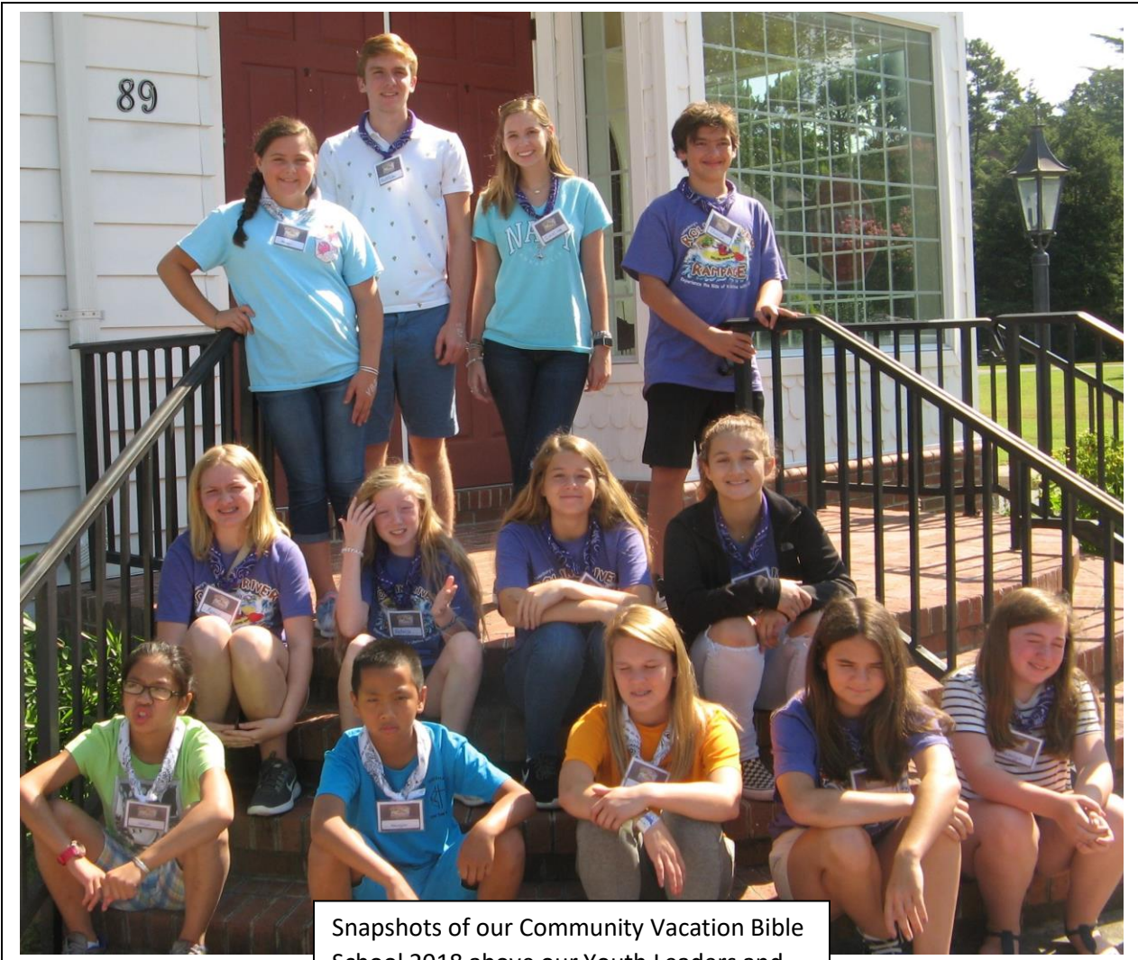
Snapshots of our Community Vacation Bible School 2018 above our Youth Leaders and Helpers (3 not pictured) Below the group picture of our VBS Rafters