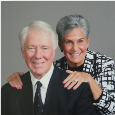
Happy 50 th wedding anniversary

"Blessed are those who die in the Lord, they will rest from their labors, and their deeds will follow the."