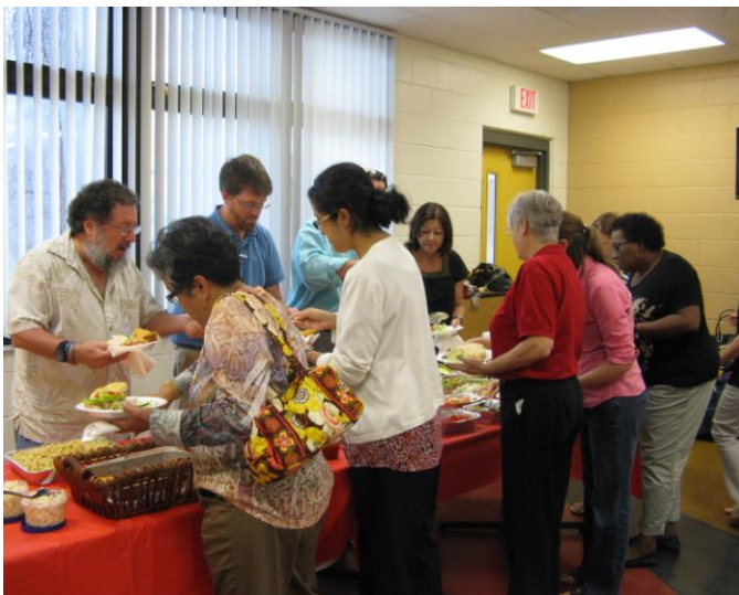
The IB Partnership-sponsored Welcome Back Teachers Luncheon on August 10, 2011.

The best way for you to know what activities we have planned for the upcoming year is by checking our website frequently. On the home page of the school website you can find a link to the IB page. On the Strawberry Crest IB page you will find links to a number of resources, including teacher websites and Edline. Our IB Parent Partnership also plans to post regular newsletters on our website throughout the year. The website address is http://strawberrycrest.mysdhc.org . Again, welcome back to the new year! Don't hesitate to contact our office if you have any questions or concerns as the year gets under way.