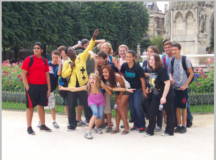
SCHS students having fun outside of Notre Dame Cathedral in Paris, Summer 2011.