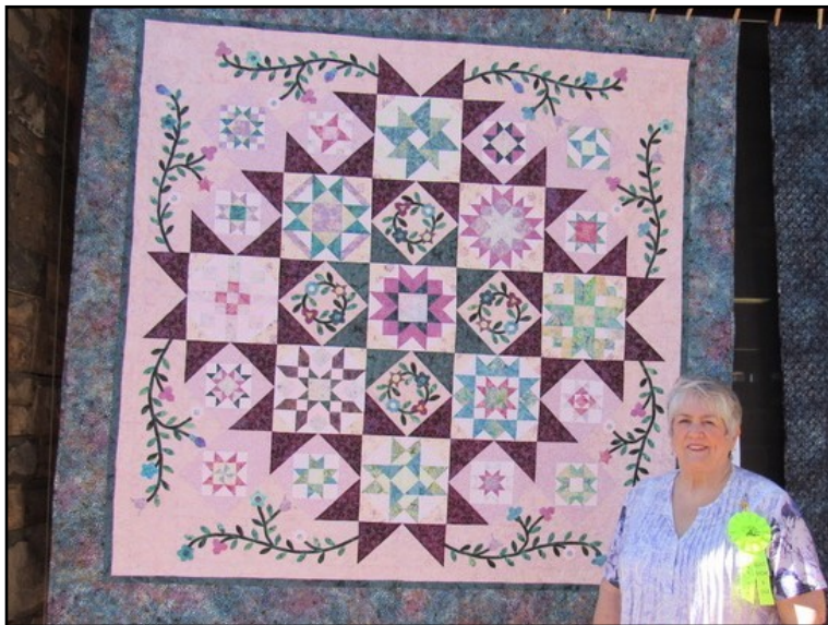
Michelle McMicken, Featured "Master" Quilter

A big thank you to the quilt shops, sewing machine shops, and long arm quilters for their donations.