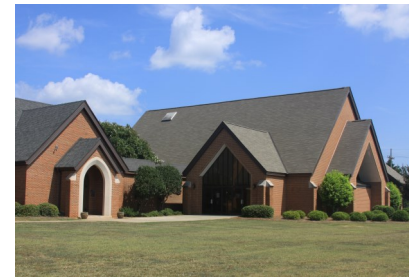
Bypass Campus (BPC)