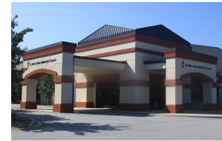
Rivers Street Campus (RSC)