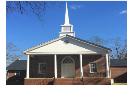
The Connection Campus (TCC)