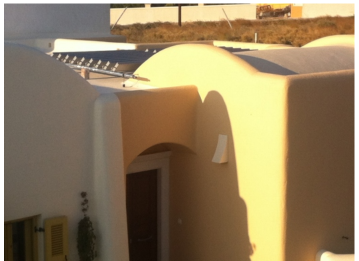
The solar panels have a very low (20 cm) 'hight profile' and are not visible from the street level.