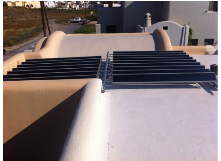
Panels can be arranged in non symmetric excentric arrays. Normally the middle double pipe is the hot water outlet.