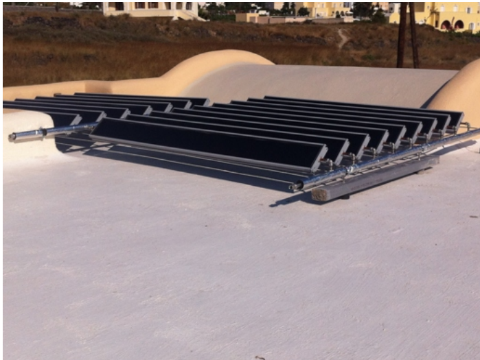
The Panels must be fixed towards a wall on at least one side, other distributor pipes can be mounted upon foundations.