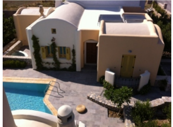
Building with Energy classification (A+)