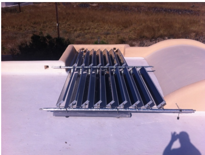
A slight inclination is necessary for open circuit systems. On closed pressurised circuits the installation can be flat.