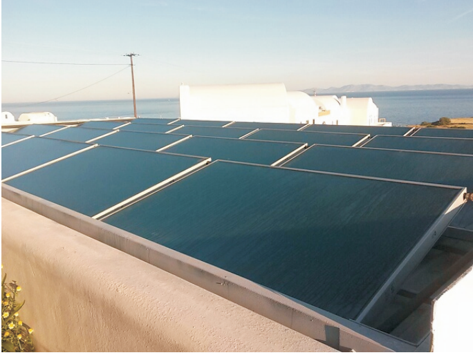
Panels are incorporated to the classical architecture looking towards SouthEast and having an inclination of + 10°.