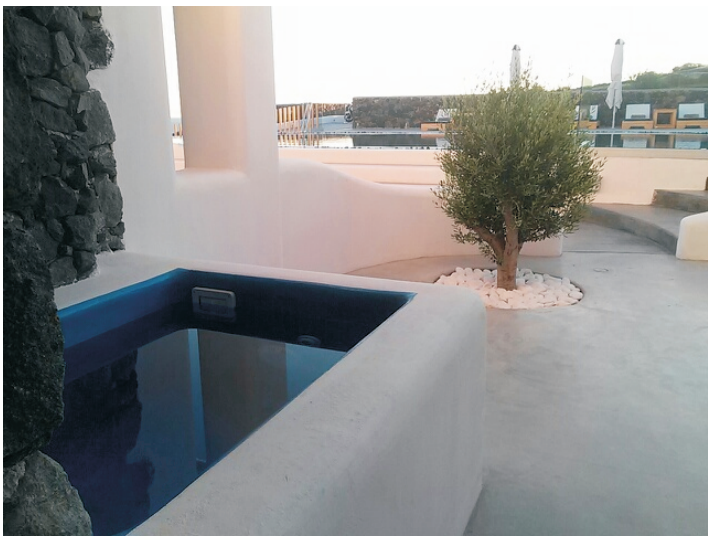
All Yacuzzi pools have well thermo-insulated walls and bottom to avoid heat losses.