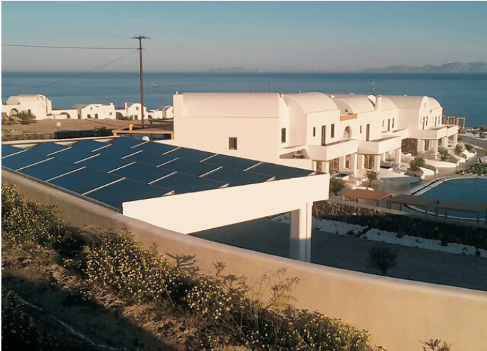
Hotel resort building with Energy classification (B+)