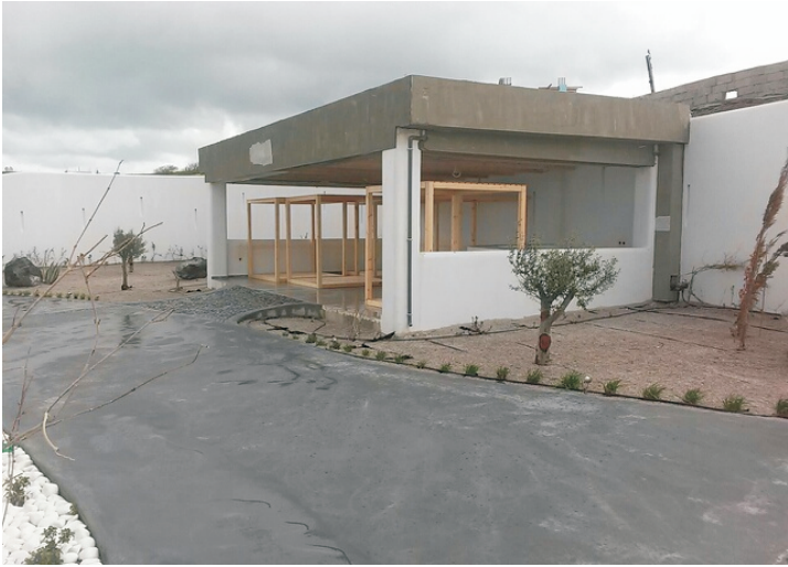
Panels are incorporated to the classical architecture looking towards SouthEast and having an inclination of + 10°.