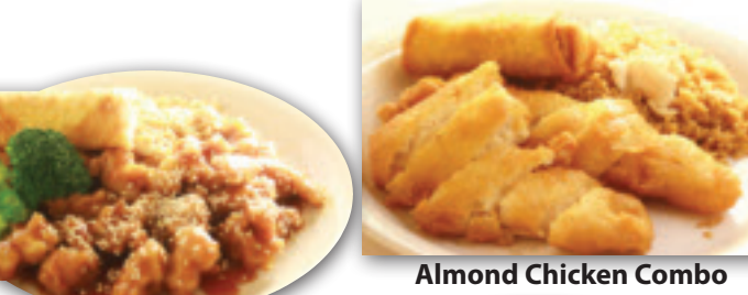
Sesame Chicken Combo

Bourbon Chicken Produced By Best Choice 1-800-783-0990