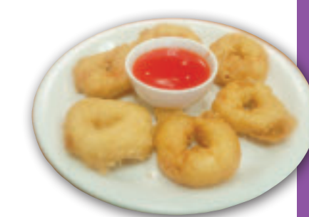
Sweet & Sour Shrimp