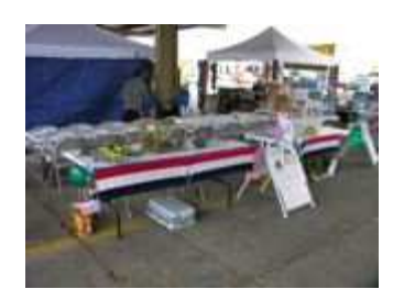
Quiet before the storm--a selection of models from IPMS Santa Rosa members, on display for the airshow crowd.