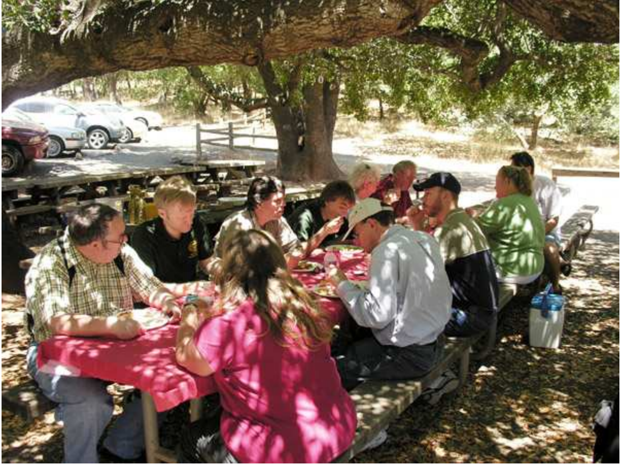
A brief silence descends over the picnic.