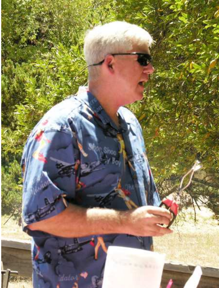
"Come and get it!"