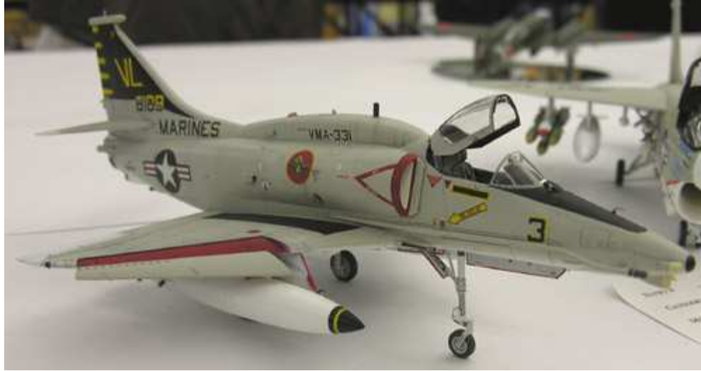
3rd - Hasegawa A-4 Skyhawk, 1/48