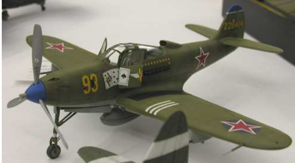
3rd - Eduard P-39, 1/48