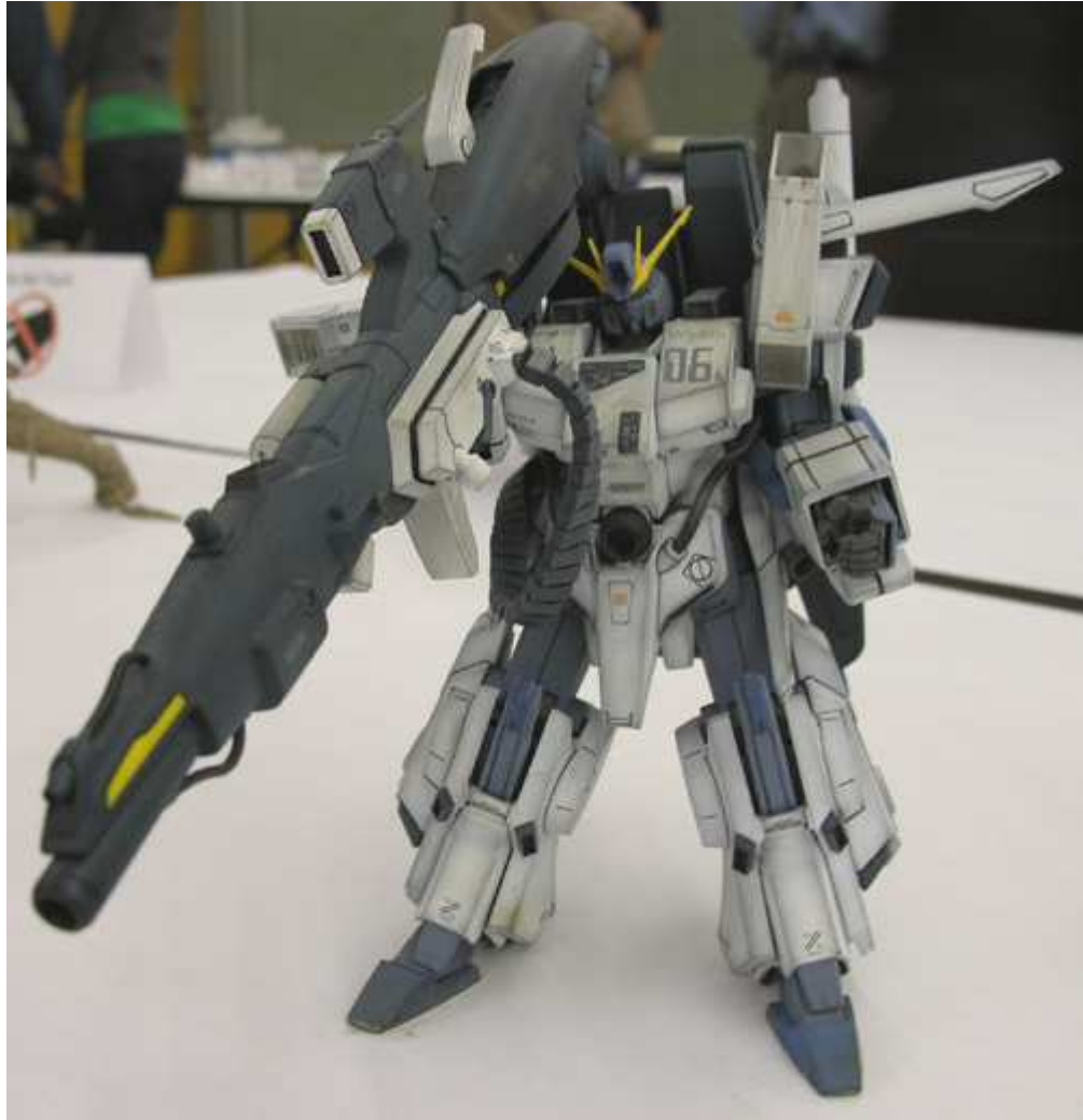
1st - Bandai FAZZ Gundam, 1/100