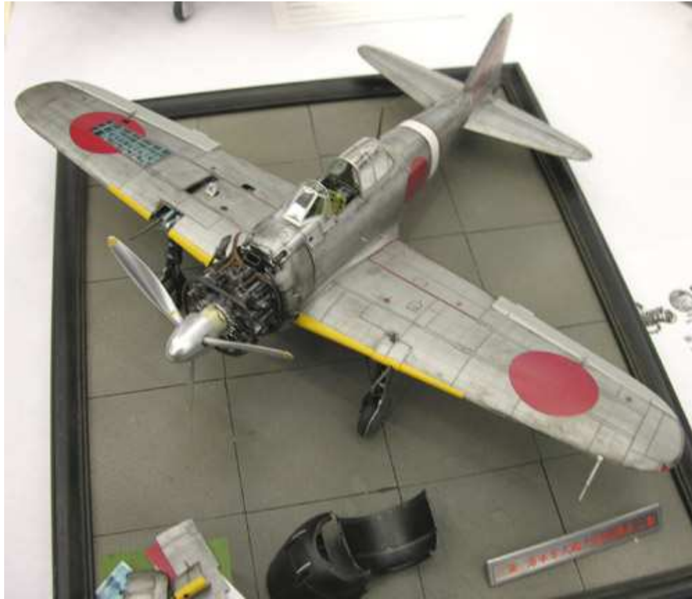
1st - Tamiya Zero, 1/32