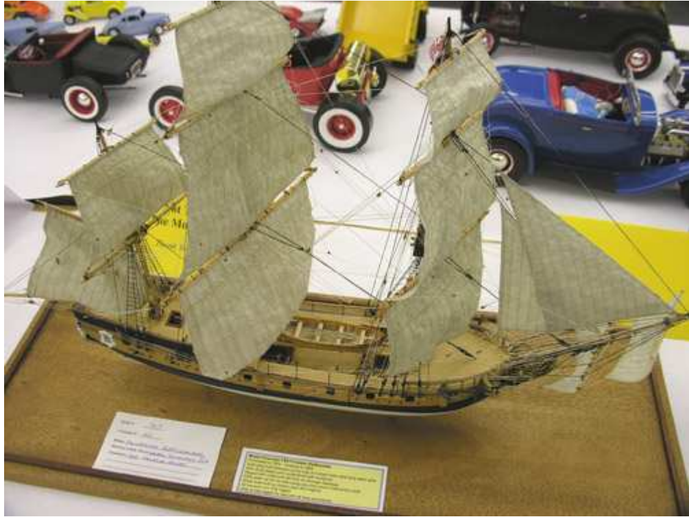
1st - Model Shipways Privateer, 1/64