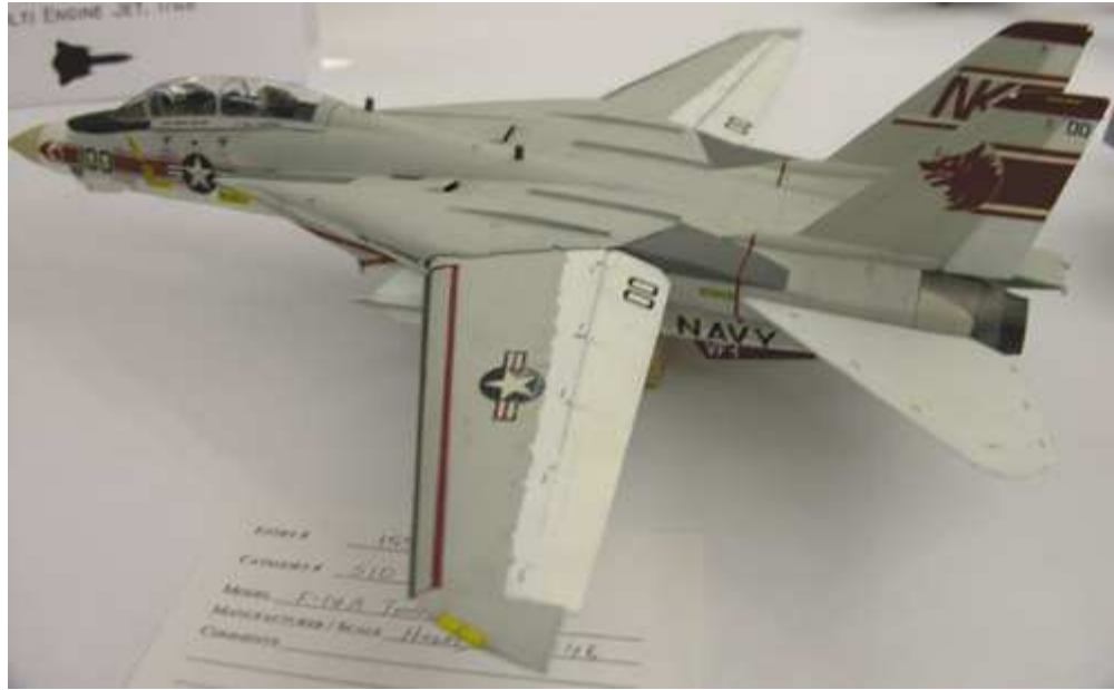
2nd - Hasegawa F-14 VF-1, 1/48