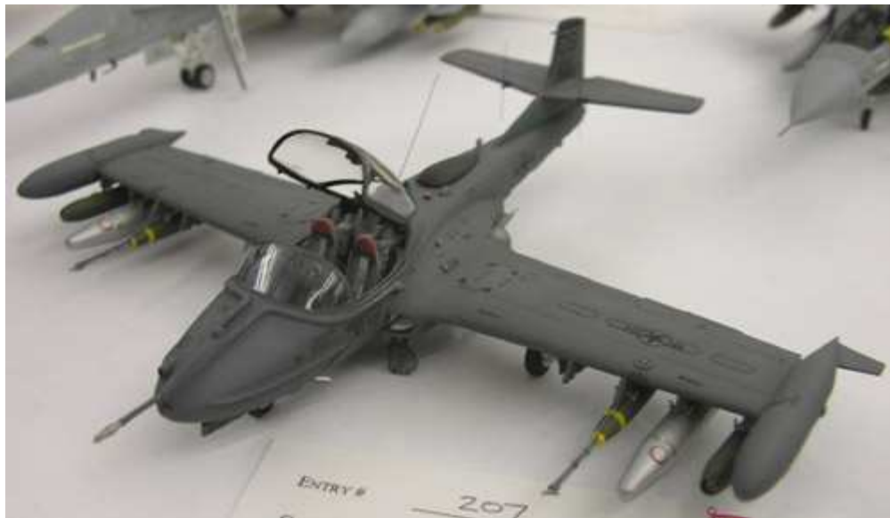
1st - Monogram AT-37, 1/48