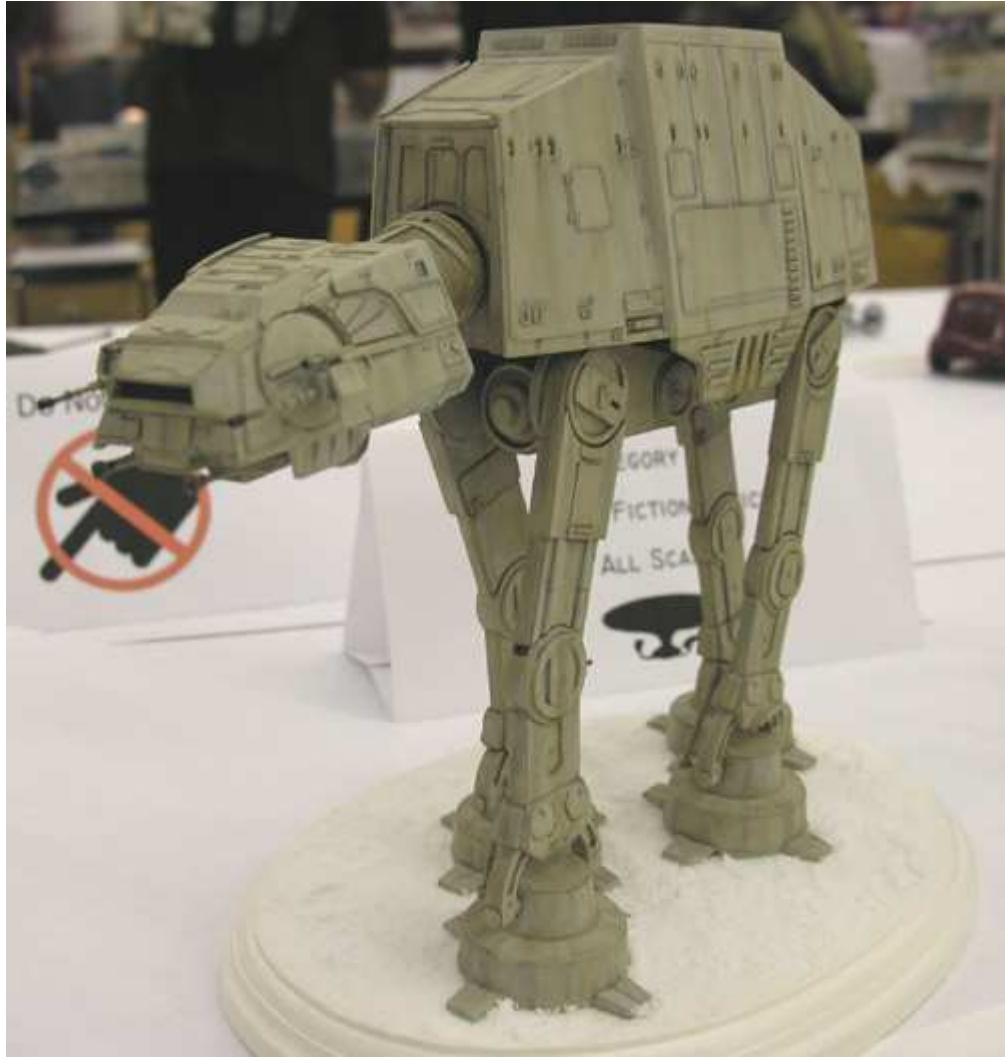
3rd - AMT AT-AT Walker