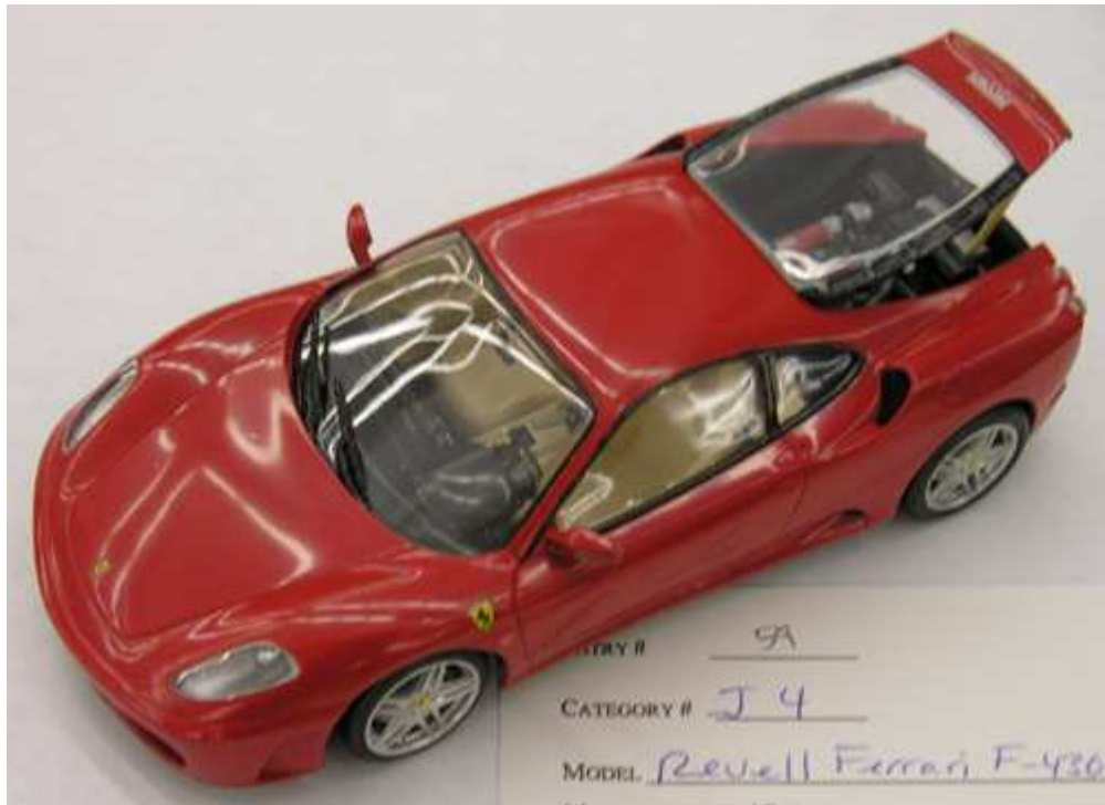
1st - Revell Ferrari F-430, 1/24