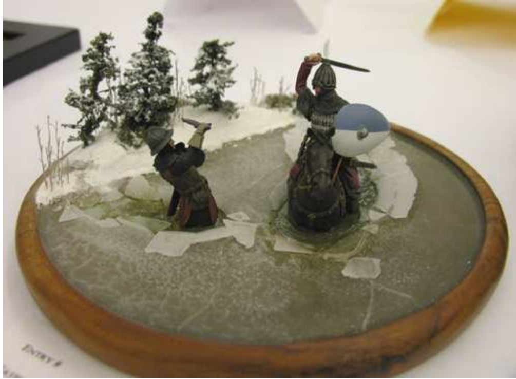
1st - Verlinden Frozen Battlefield, 1/35