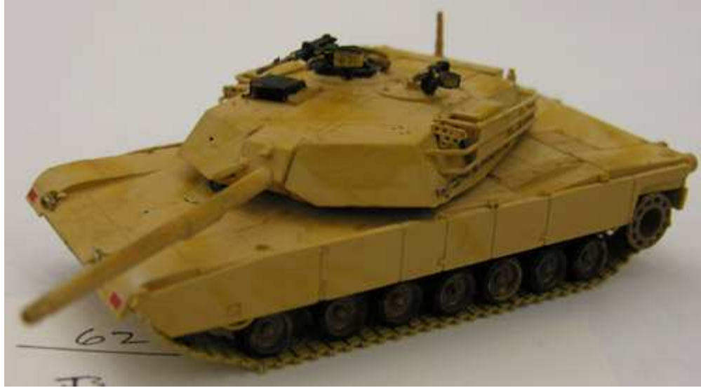
3rd - Italeri M1 Abrams, 1/72