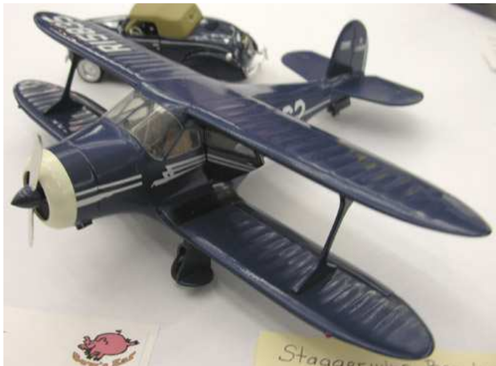
2nd - Beech Model G17, 1/32