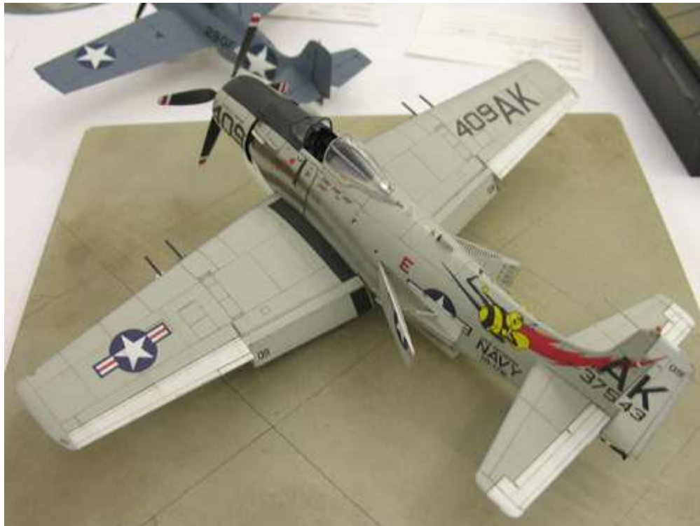
2nd - Skyraider A-1H Skyraider, 1/48