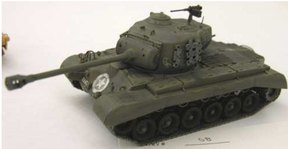
1st - Tamiya M-26 Pershing, 1/48