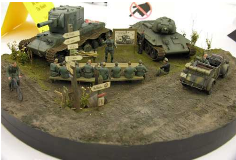
2nd - Tamiya Panzer Destruction Class, 1/35