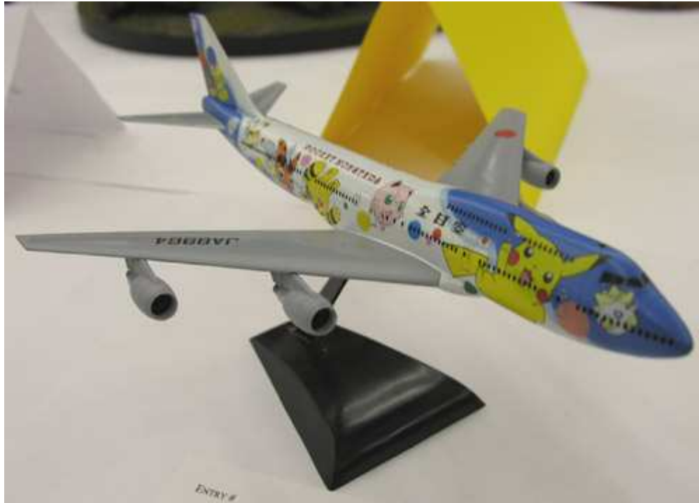
1st - Tomy 747 Pokemon, 1/300