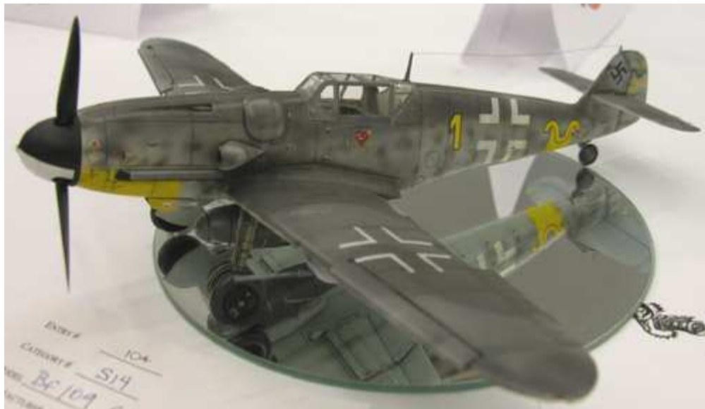
2nd - Hasegawa Bf-109G, 1/32