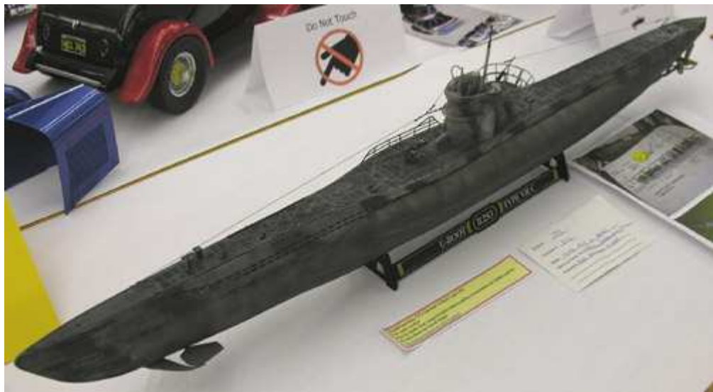
2nd - Revell Type VIIC U-boat, 1/72