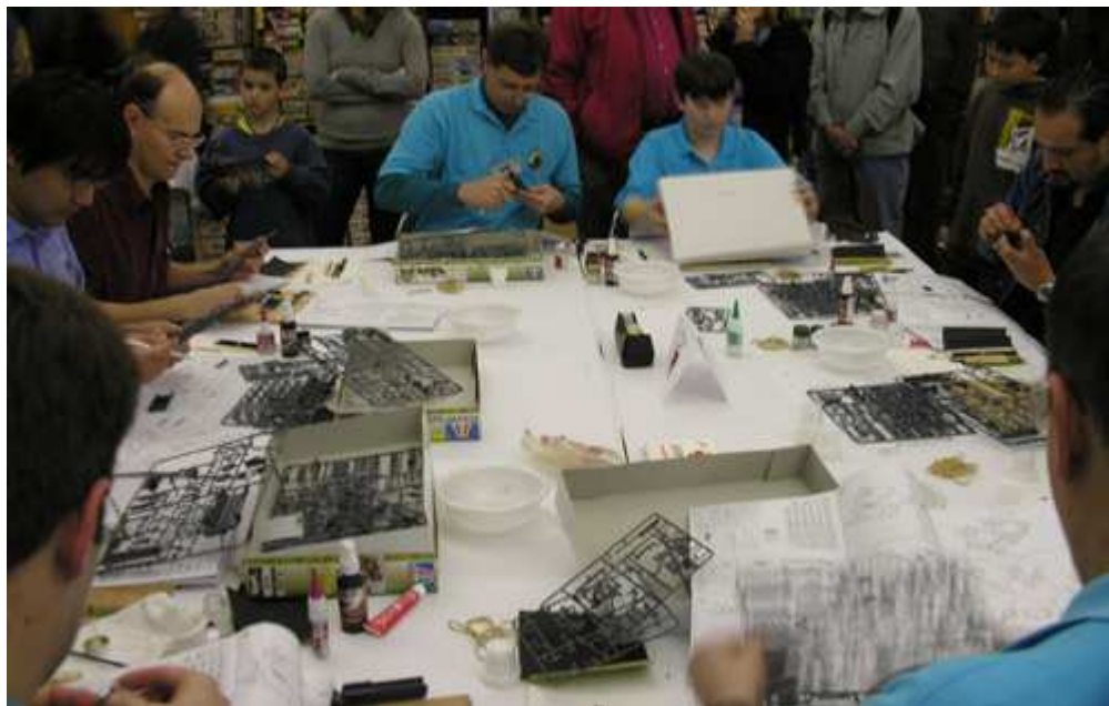
This year's Speed Build, again organized by Lloyd Holcomb, featured the Italeri Demag Halftrack with Pak 38. The complexity of the kit, with over 200 parts and individual track links, presented a great challenge to all builders. Few participants made it to the painting stage, unlike last year.