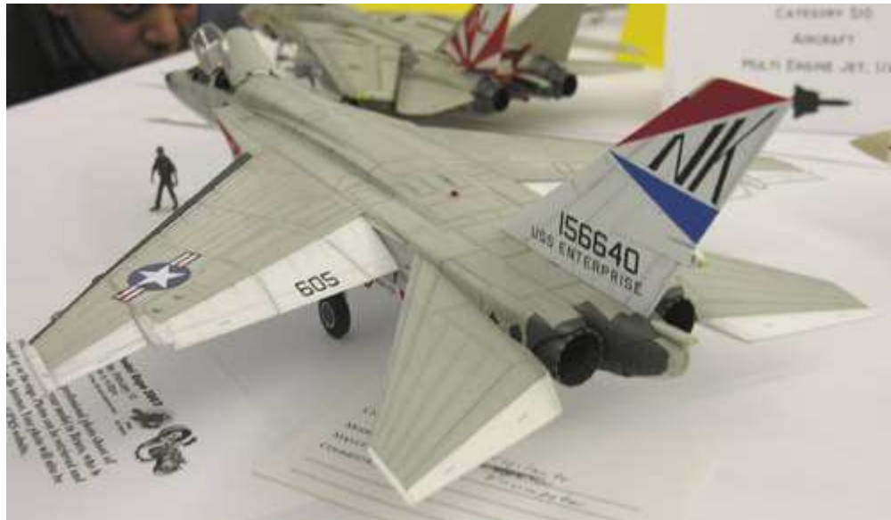
3rd - Trumpeter RA-5C Vigilante, 1/48