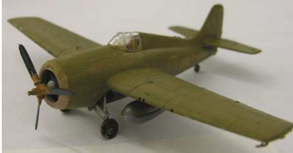
3rd - Academy F4F Wildcat, 1/72