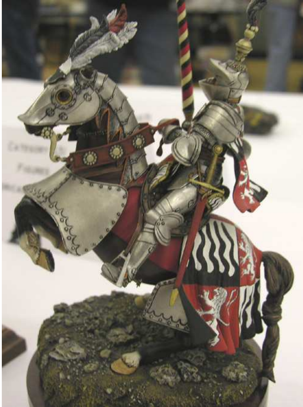
2nd - Amati Curisier, 200mm