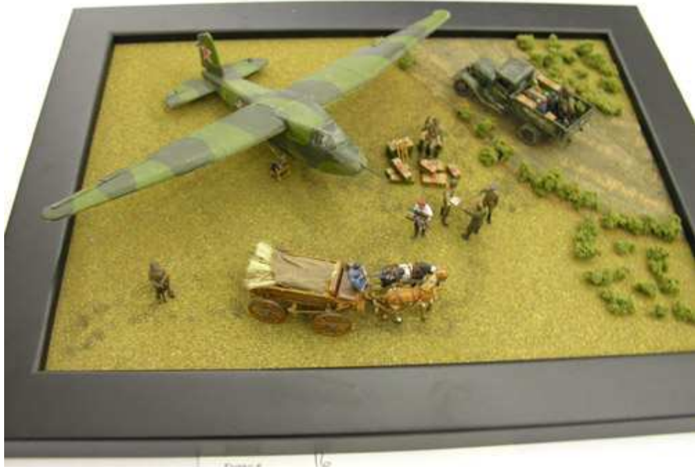
3rd - AER Russian Glider, 1/72