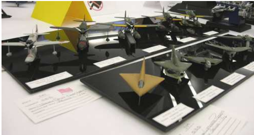
1st - Japanese floatplanes, 1/72