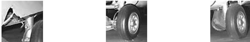
• Image 18: Left side, looking aft. The doors and well interior are mostly aluminum paint.