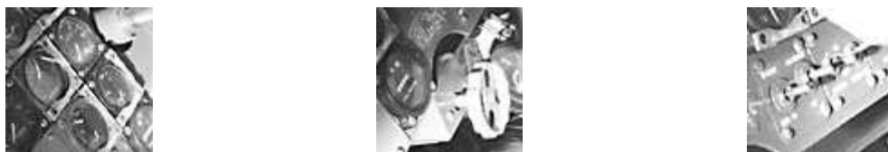
• Image 20: Most of the airframe and instrument panel surfaces are medium grey. The seat frame is a little lighter grey. The cockpit floor hatch is green chromate. The instrument bezels are black. Throttle knobs are white. Gear retraction knob is black. That big "facet" handle in the foreground appears to be silver. Assorted switch covers are red.