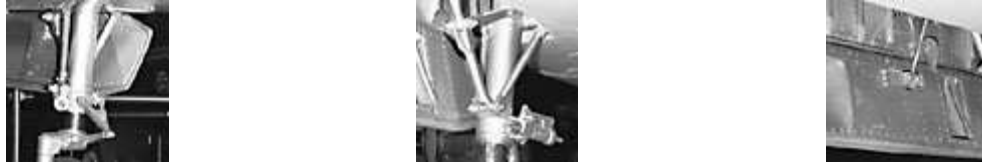
• Image 16: The nose gear well and door are painted aluminum.