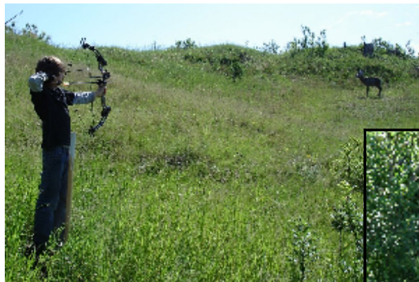
Pictured: Cby Archer's Club held an archery competition for all ages on Father's Day.