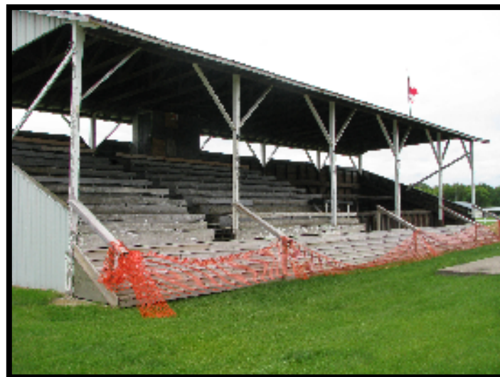
Pictured above: the Carberry Ag. Society grandstands that are in much need of repair. Hopefully before fair dated July 1-3, 2011.