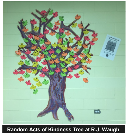
Random Acts of Kindness Tree at R.J. Waugh