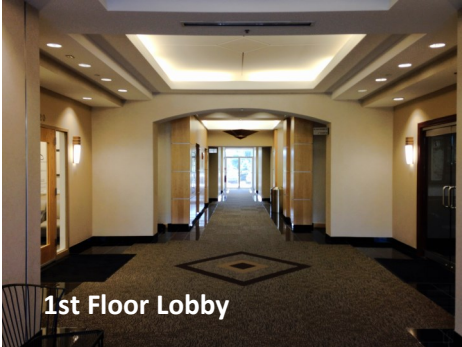
1st Floor Lobby

2,649 Sq. Ft. Prime Office Suites Libertyville Offices at Pine Meadow 900 Technology Way • Suite 270 • Libertyville • IL 60048