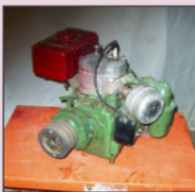
4 HP Kohler engine with gear reduction. It runs but needs some work on the speed control. Asking price $150