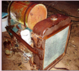
Continental 6 cylinder engine about 1940. It is complete but not free. I think it was used on a Oliver combine. Asking price $50

Call today, Clair St. Clair 520 378-0111 Sierra Vista, AZ james@cis-broadband.com