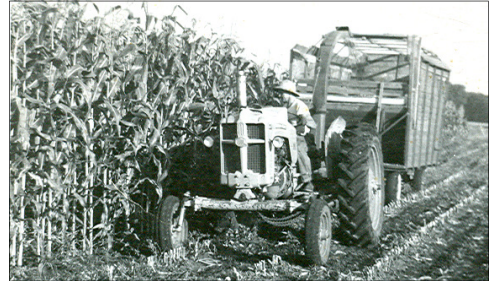
Clarence Fieber chopping corn in 1961 in Wisconsin

Club workers are needed... service to others as you are able