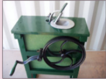
CORN SHELLER restored & painted green Asking $200