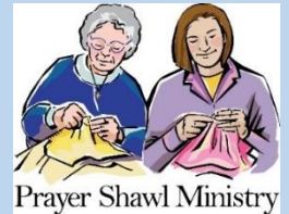
Prayer Shawl Ministry

Our Prayer Shawl Ministry continues to add to the lives of all who receive them; so much so that we are running very low on our wonderful prayer shawls! Prayer Shawls continue to be greatly needed! Our meetings are every 3 rd Sunday of the month from 2-3:30 p.m. Hope to see you then! Please continue to make shawls. Prayer shawls should be 25-30 inches wide and 70 inches in length. See you on February 16!