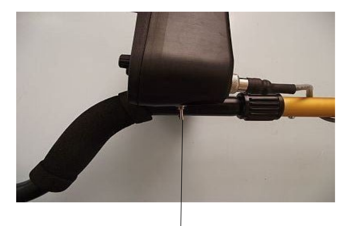
THREE POSITION TRIGGER SWITCH (MIDDLE POSITION) ALL METAL MODE

Use the All Metal Mode (Trigger in the middle position) for maximum depth where soil conditions allow. In this position, you are detecting without any discrimination. All metal targets will sound off with a high tone. We recommended using this Mode only if you do not want any discrimination or where only good targets are anticipated.