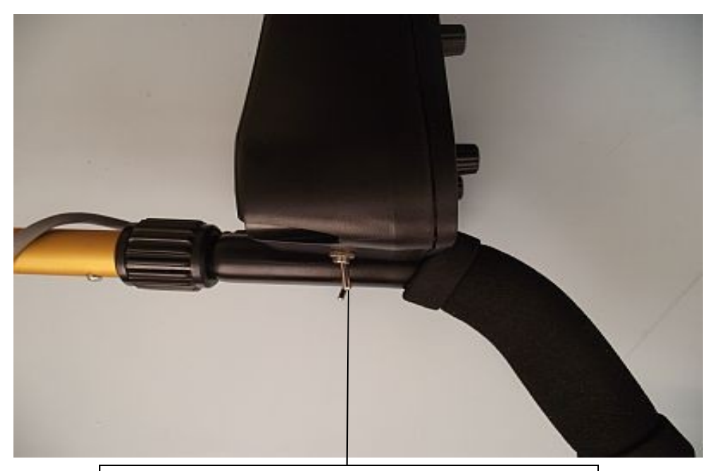
TWO POSITION TRIGGER SWITCH BACK POSITION (Trigger towards you.) BOOSTER OFF

> Booster Off (Trigger in back position, towards you.)