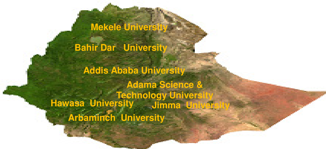
Figure-1: Former E-Learning Activist's Distributions In Ethiopian Universities