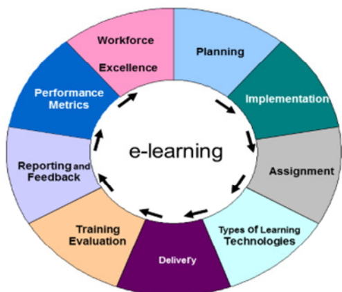
Figure-3: Delivering e-learning in ASTU

Considering the above trends of the overall activities of the e-learning center, the findings draws a conclusion regarding the potential impact of e-learning to significantly affect ASTU's learning teaching standards. Identifying the actual impact that e-learning programs have had on students, teachers and schools is, however, difficult. Because of the newness and diversity of the programs and the complexity of factors affecting outcome, measuring e-learning's impact is an emerging science. [6] Nevertheless, some direct and indirect outcomes can be discerned. They are presented below by e-learning's impacts on students and teachers.