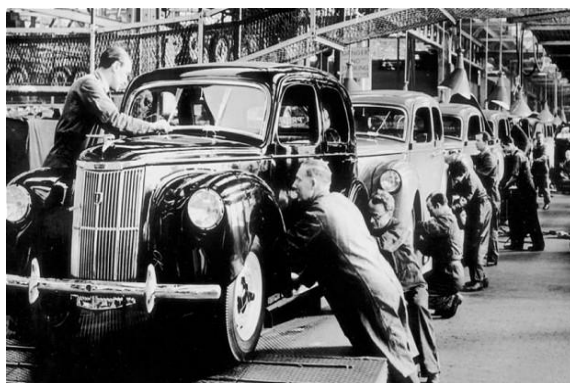
A 1950's labour intensive Dagenham production line at the Ford factory.

Send you information to mrmartinross@gmail.com and we will put it on the website for FREE