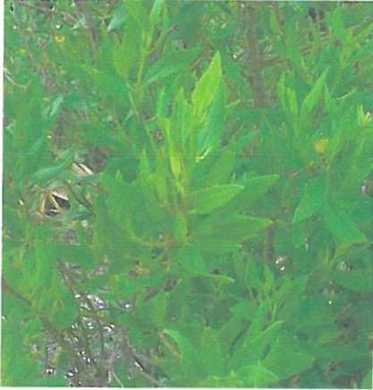
Marsh elder Iva frutescens