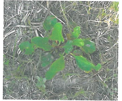
Sea lavender Limonium carolinianum