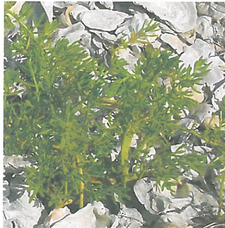
Saltwort Batis maritima