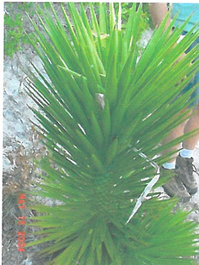
Spanish bayonet Yucca aloifolia NON-NATIVE