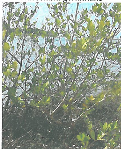
Black mangrove Avicennia germinans