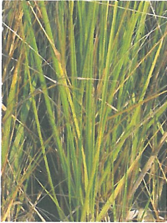
Smooth cordgrass Spartina alterniflora