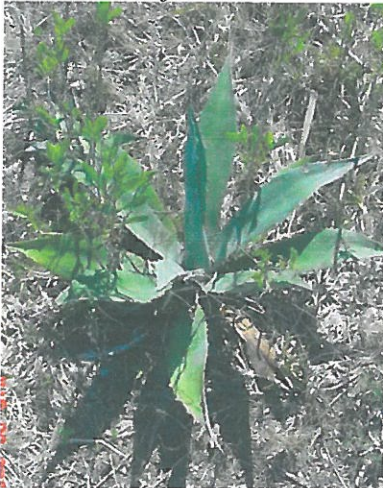
Adam's needle Yucca filamentosa