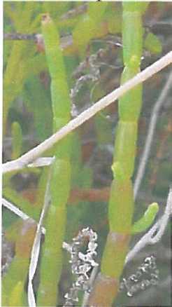
Glasswort Salicornia perennis