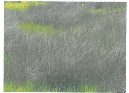
Black needle rush Juncus roemerianus