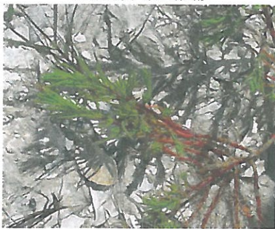
Sea blite Suaeda linearis