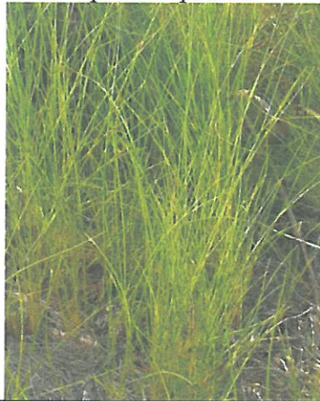
Saltmeadow cordgrass Spartina patens