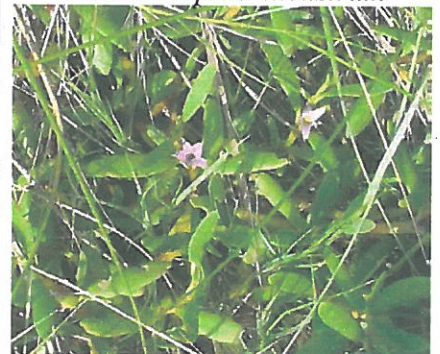
Sea purslane Sesuvium portulacastrum