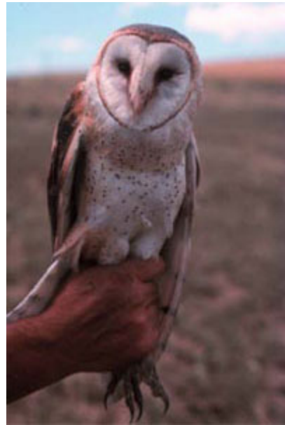
Barn Owl Tyto alba