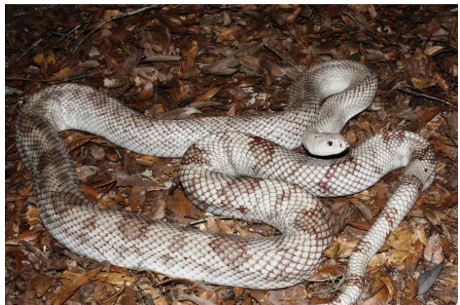
Florida Pine Snake Pituophis melanoleucus mugitus (State Threatened)