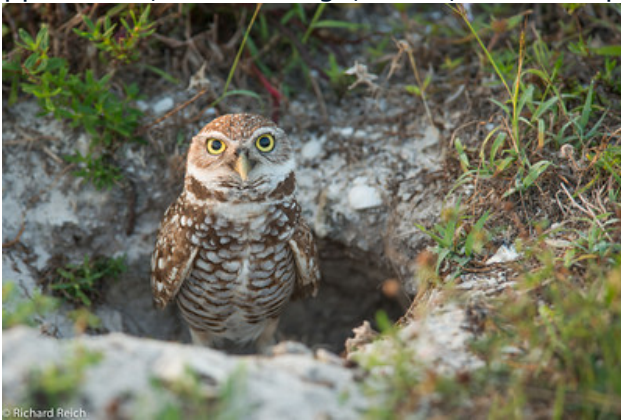
Florida Burrowing Owl Athene cunicularia (State Threatened)

There are five common species of owl live in Florida, the great horned owl, barn owl, screech owl, burrowing owl, and barred owl. Most owls are nocturnal and nest in trees, caves, barns, tree cavities, and sometimes large nest boxes. Burrowing owls are unique in that they live in open treeless areas and nest in burrows similar to a gopher tortoise (sometimes even using old gopher tortoise burrows). They are also active during the day and night. The barn owl is the least common in Florida out of the five and is very different in appearance, with its large, white, heart-shaped face.