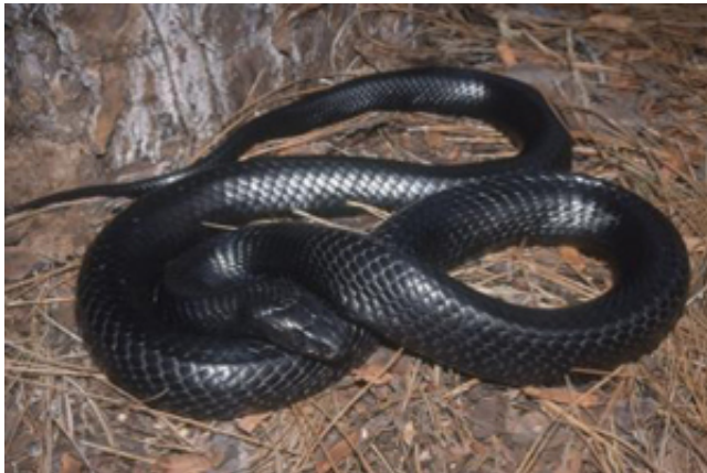
Eastern Indigo Snake Drymarchon couperi (Federally Endangered)

Florida is home to 45 native species of snakes (only 6 of them are venomous). These are found in every conceivable habitat, from coastal mangroves and salt marshes, to freshwater wetlands and dry uplands, and many species thrive in residential areas.