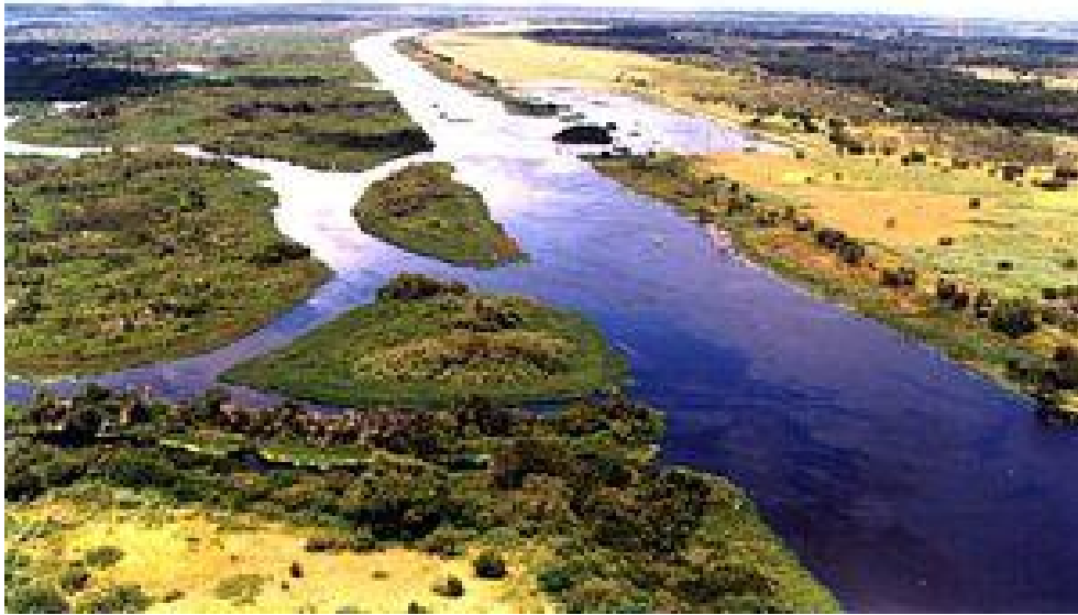
A stretch of the straightened and channelized Kissimmee River in central Florida

Key Concept: The floodplain, or watershed of the river supports a diverse community of waterfowl, wading birds, fish, and other wildlife, extending from the headwaters of the Kissimmee River to the Florida Everglades and Florida Bay.