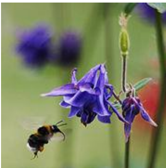
Pollination by a bumblebee, a type of ecosystem service

The May 15, 1997 edition of the journal Nature had an article that estimated the value of ecosystem services in the world. The authors estimated that the 'goods delivered to humans, by earth's ecosystems, had a value of about 33 trillion dollars per year. That estimate dwarfs the estimated human produced gross economic product of 18 trillion dollars. The implication is that if we damage our ecosystems too much, this 33 trillion-dollar service will not be there for us to use, and we will be poorer in many ways. Go to: