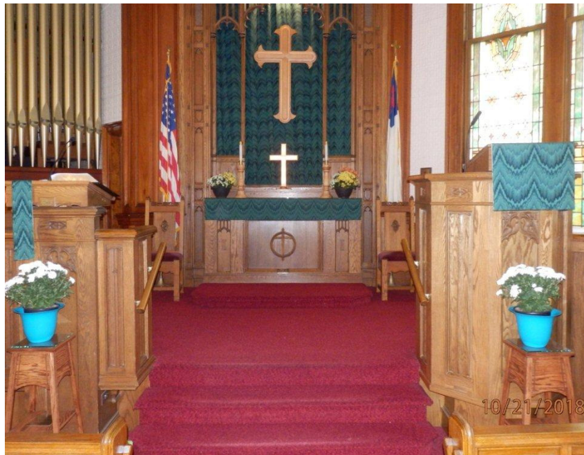
Oct 21 - Fall flowers adorn the sanctuary's altar area!