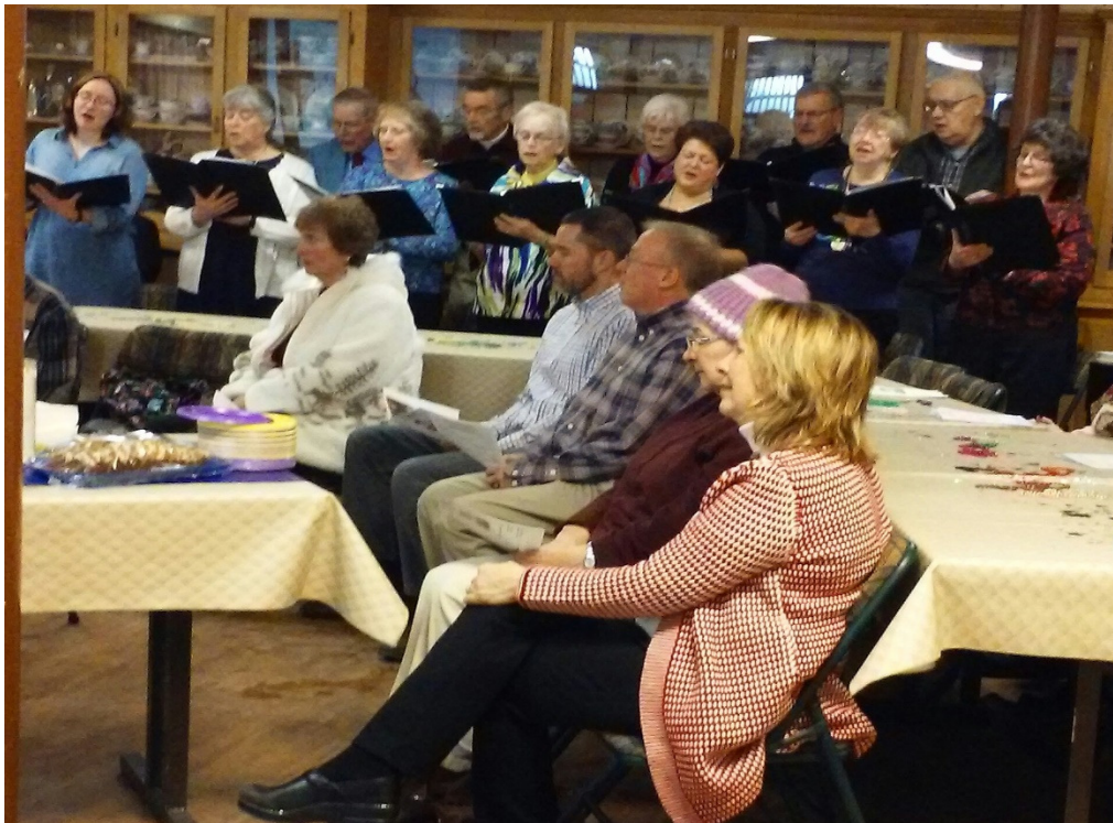
The Senior Choir sings during the Mardi Gras Worship Service.