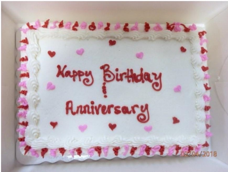
Special "Valentine Day Themed" Birthday & Anniversary Cake on Sunday, February 4 th !