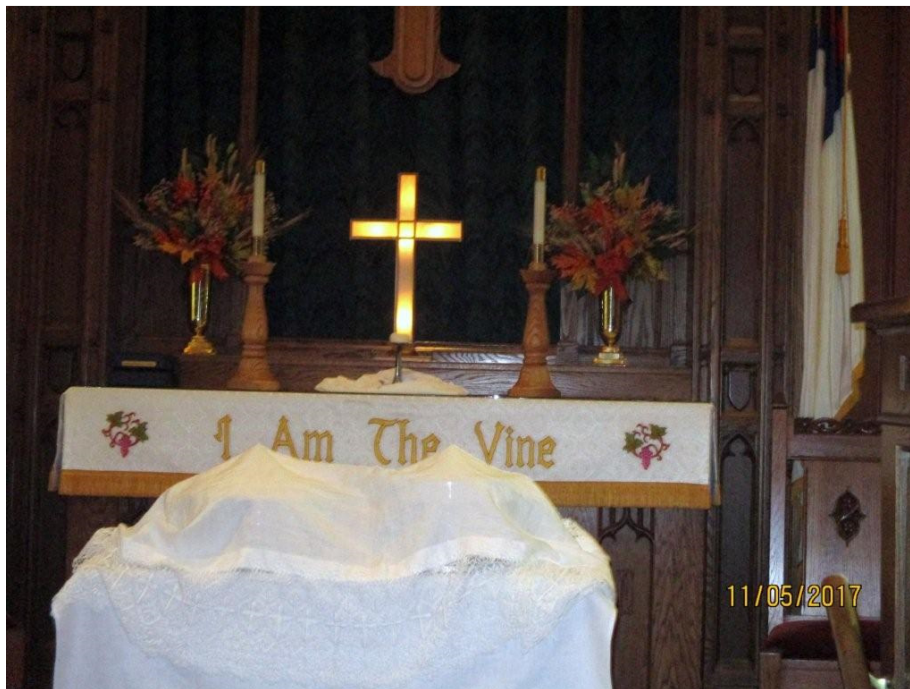
November 5 th - We honored Thelma Mockler on "All Saints Sunday" with one single candle on the altar in front of the lighted cross.