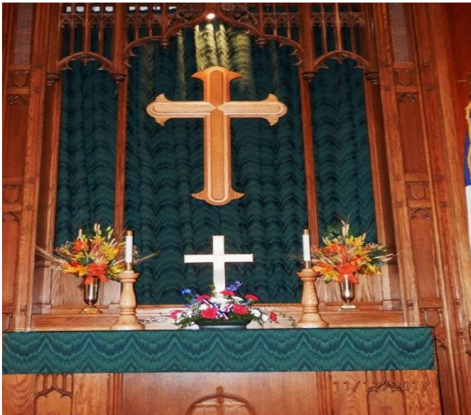
Nov 12 - Special flowers on the altar to honor Veterans!