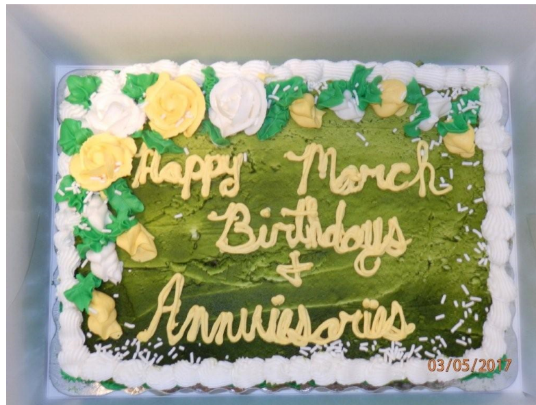
Special Coffee Fellowship Cake on March 5 th !