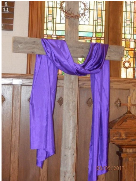
The Lenten cross draped with purple