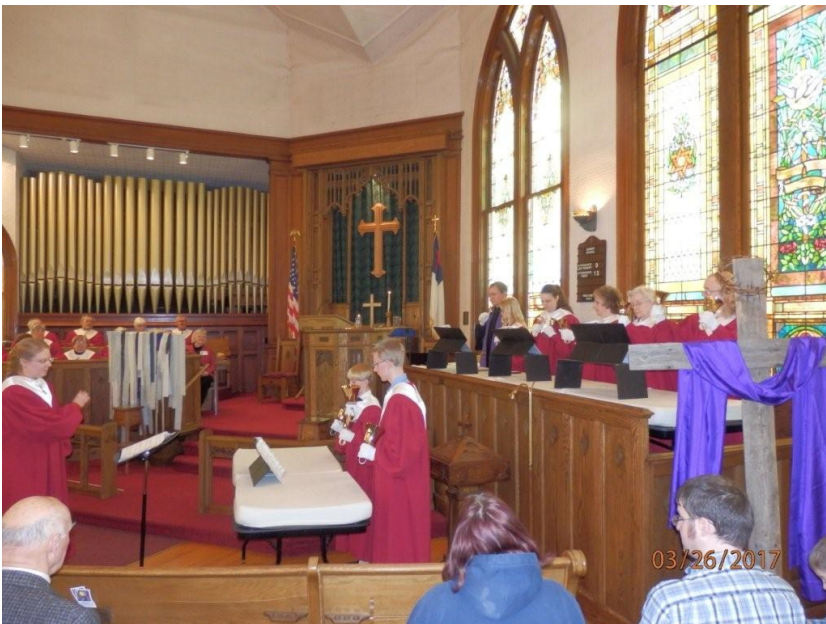
March 26 – Handbell Choir performs “How Great Thou Art”