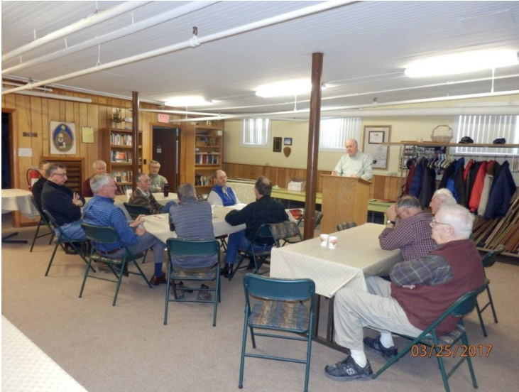
March 25 – UMM Meeting at church