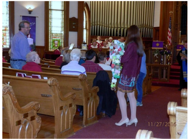
Congregation members receive "chains"