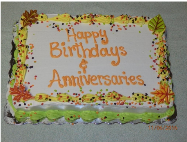
Special Cake on Sunday, November 6 th .