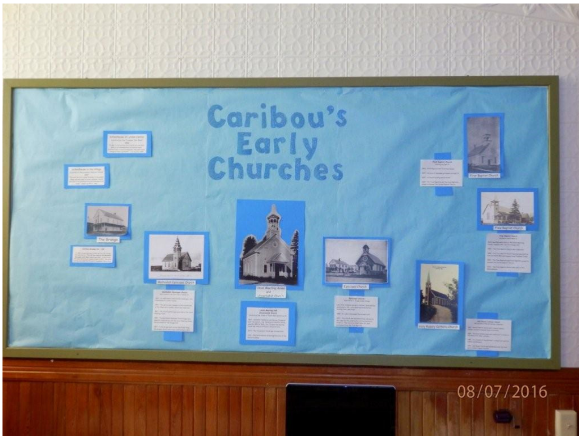
Take some time to take a look at this unique and interesting library display of "Caribou's Early Churches"! Created by Wendy Bossie!