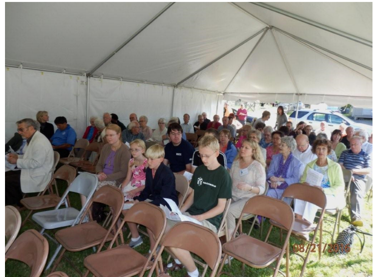
Pictures of the congregation attending this special "Service by the Garden"!