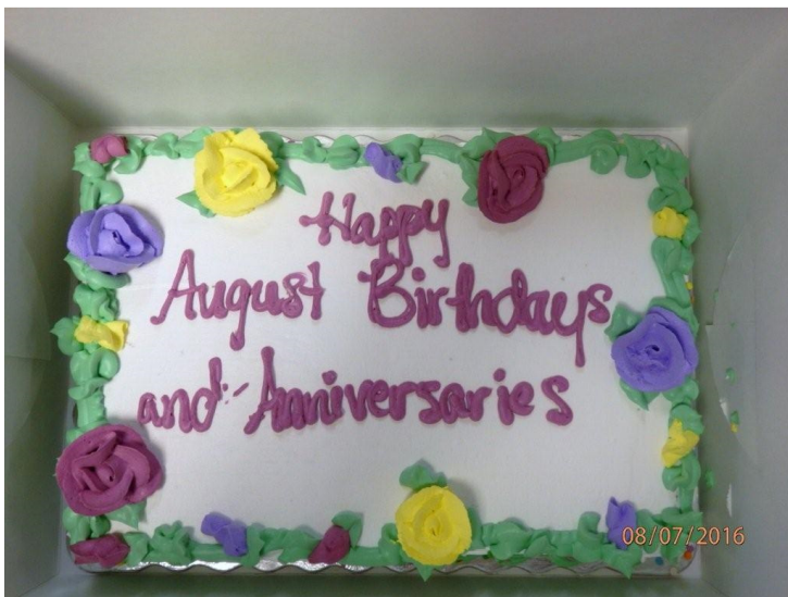
Birthday & Anniversary Cake on Sunday, August 7 th !