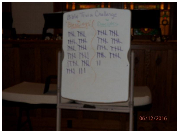
End Result? The "Blessings" won! We all learned a lot!