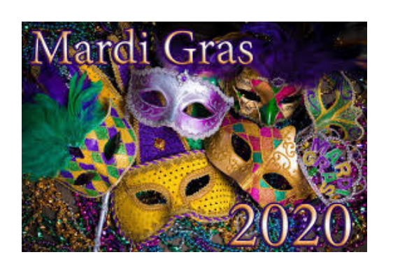
Shrove Tuesday Pancake Dinner

During Coffee Fellowship on Sunday, February 23rd, we will celebrate "Mardi Gras" with special decorations and a "King Cake" with a hidden baby inside! The baby symbolizes luck and prosperity to whoever finds it in his/her slice of cake. That lucky person is also responsible for purchasing next year's cake!