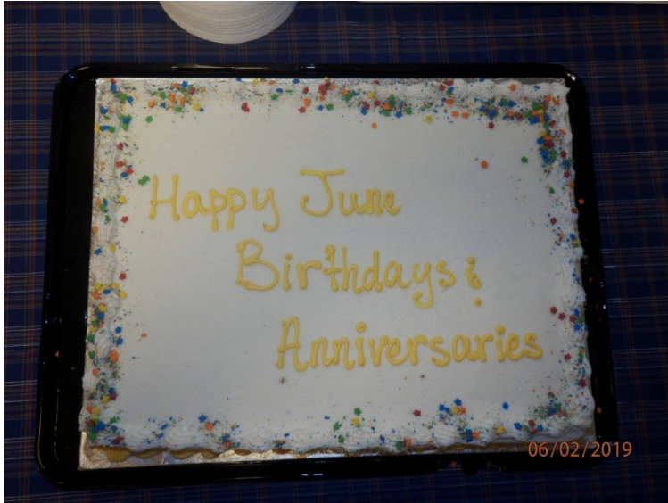
June 2 - Special Cake during Coffee Fellowship