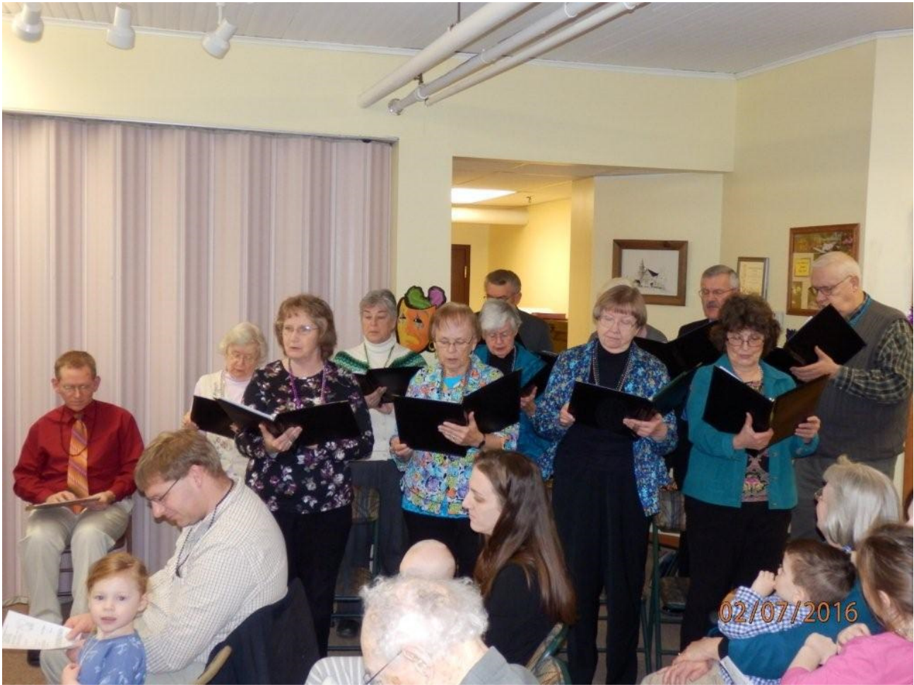
The Senior Choir was really close to the Congregation!