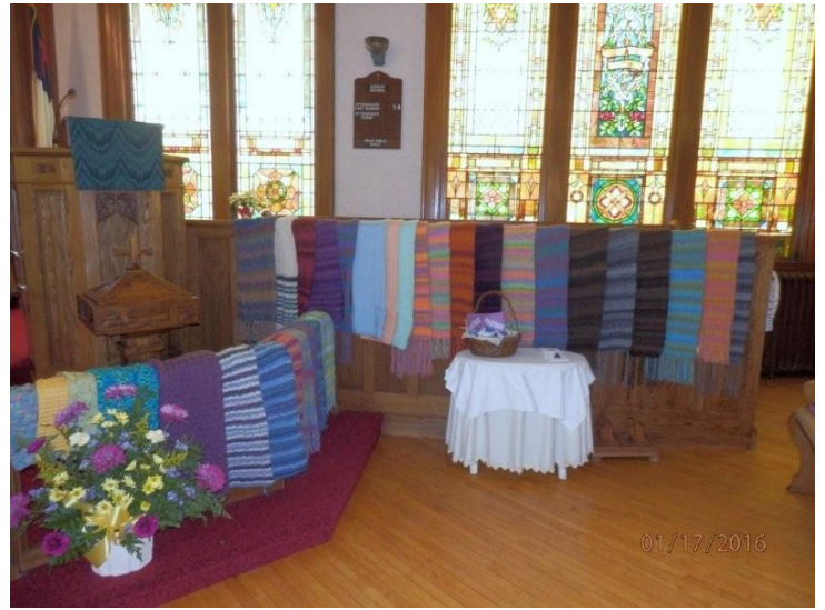
Prayer Shawl Dedication on Sunday, January 17th