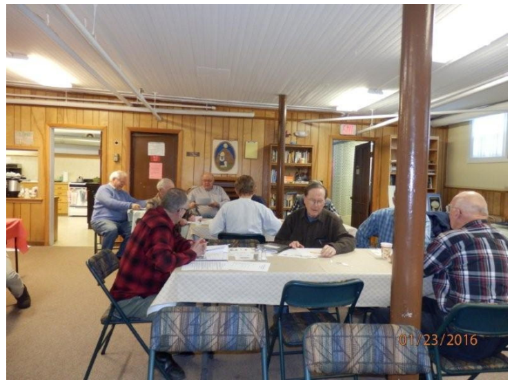
The UMM Breakfast on Saturday, January 23rd